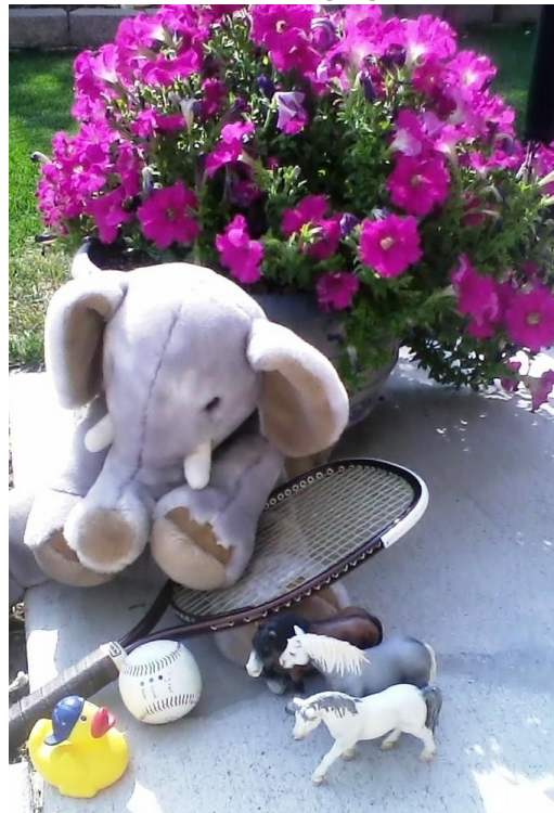
Children Long Ago

Children long ago worked hard. They had fun, too! Do you think they would like these toys?