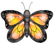
Children Long Ago